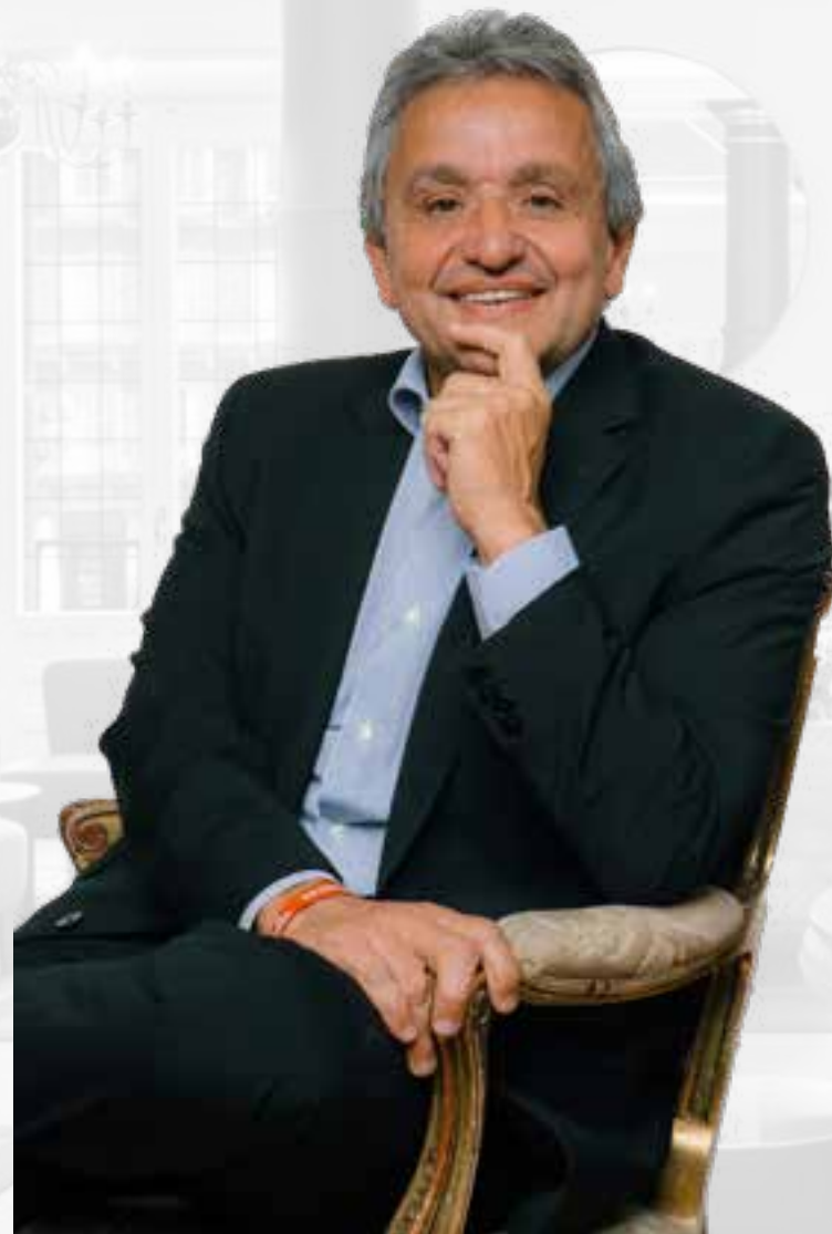
Chairman - Dionísio Pestana, founders' son